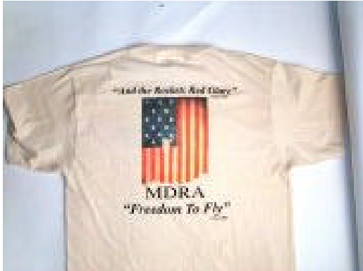
MDRA "Freedom" t-shirt for the Liberty Project.

Phone (202) 723-8257, fax (202) 723-0010.