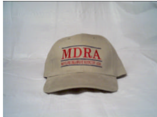
MDRA newly designed hat in two styles of hats.