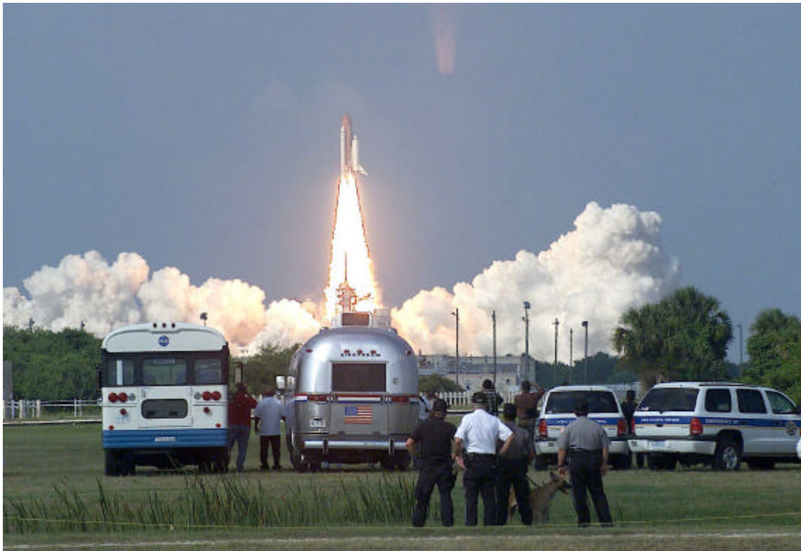
A Friend of one of MDRA's members works at the Cape and sent this picture for us